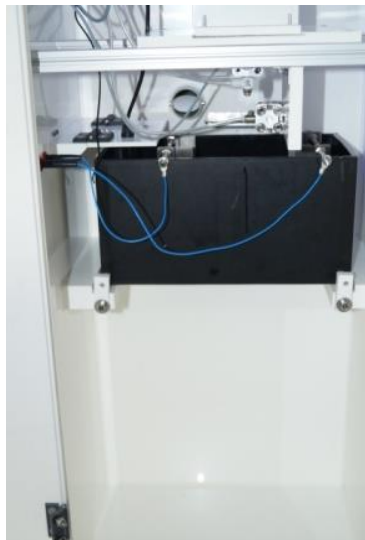
Process tank and contact changing system